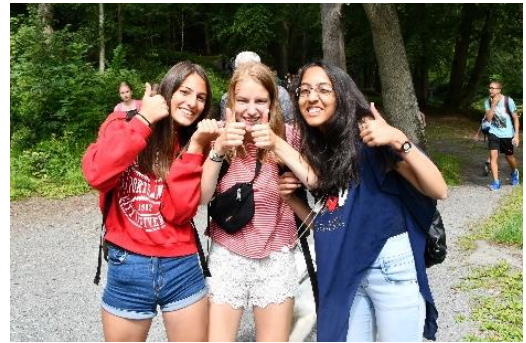
3 friends from 3 different countries!

Young people have stronger self-identities if they know who they are and how they are both similar to, and different from others. It's about understanding and valuing others as individuals, communities and cultures.